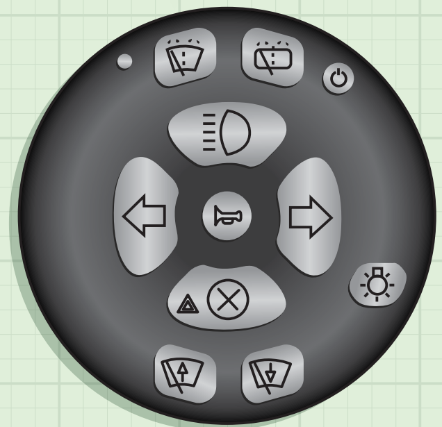
Example of a R210 unit

*Available functions can vary from car to car